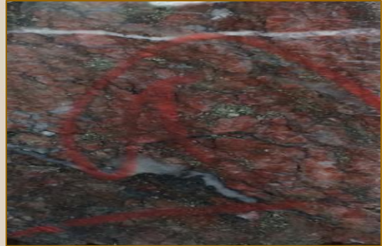
South West deposit (Golden Highway)