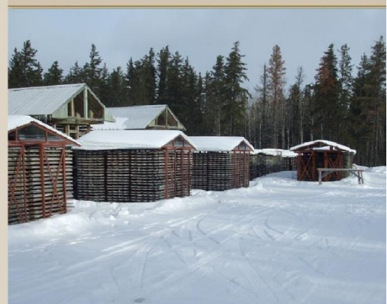
Moneta core farm: 250+ km of historical drill core